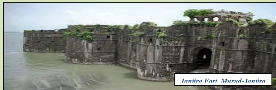
Janiira Fort Murud-Janiira