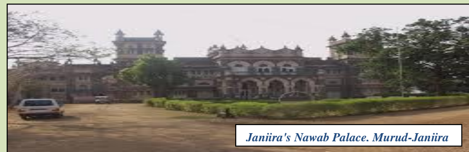
Janiira's Nawab Palace. Murud-Janiira